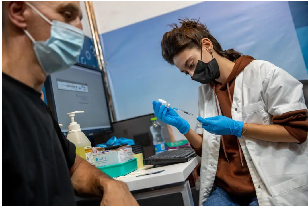
A nurse about to administer a booster shot at a medical center in Jerusalem last week.